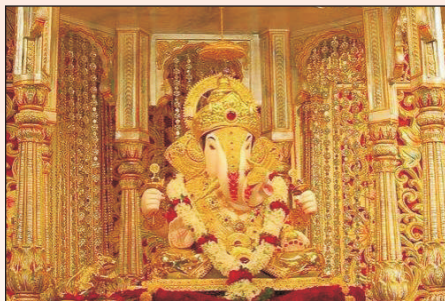
Dagadusheth Halwai Ganpati